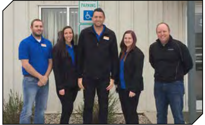
Magnum Companies 504 N Corporation St • 605-339-3804 www.magnumlog.com