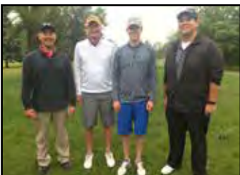
Flight 2, 1st Place (T) 3M "The Big Kahunas"