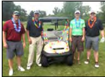
Flight 1, 2nd Place (T) Eide Bailly