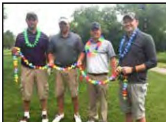
Molded Fiber Glass