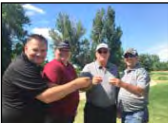
Flight 2, 1st Place (T) Reunion Student Loan Finance