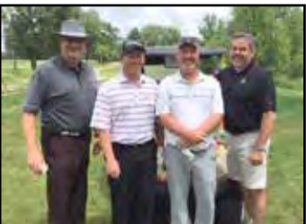
First State Bank