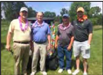
Aberdeen American News