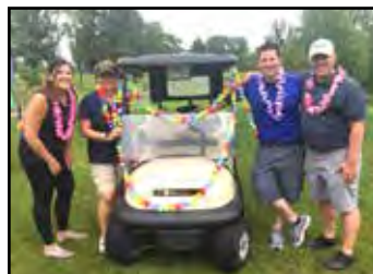
Flight 3, 3rd Place (T) Plains Commerce Bank