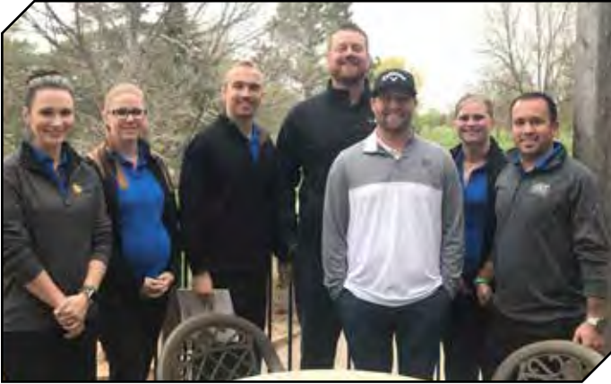
Lee Park Golf Course 1028 8th Ave NW • 605-626-7092 www.aberdeen.sd.us/148/Lee-Park-Golf-Course