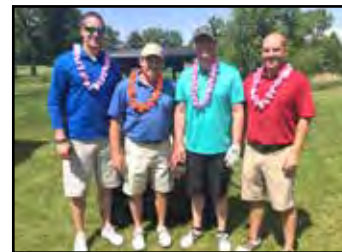
Flight 3, 2nd Place Aberdeen CVB