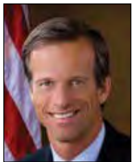
John Thune US Senator (R-SD)

I can't think of another period of time while I've served in Congress when we've been able to put so many points on the scoreboard for the American people. Over the last year and a half alone, despite the historic levels