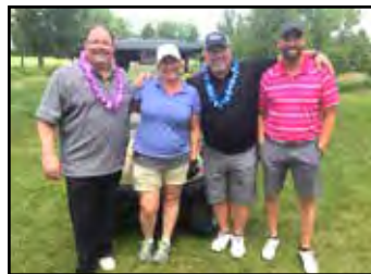
Flight 3, 1st Place Best Western Ramkota Hotel