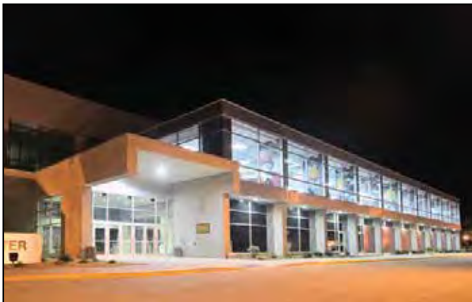
Barnett Center Addition - Aberdeen, SD

Each of these tools aim to help law enforcement do their job better and more safely. This, in turn, helps ensure South Dakota remains a safe place for families and businesses to thrive.