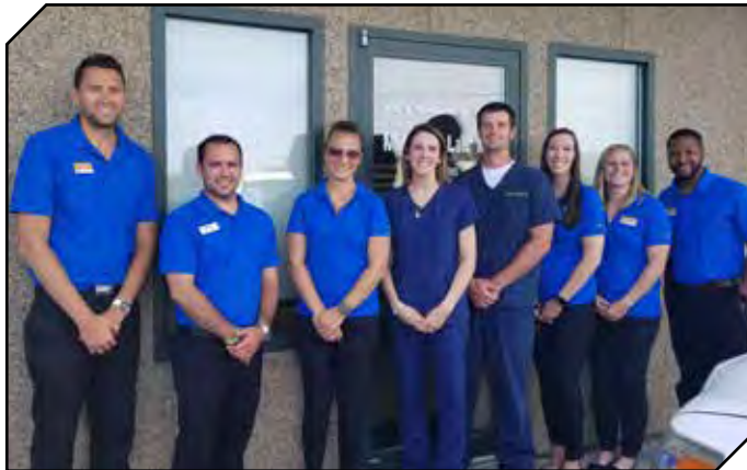
Mid Star Lab, Inc. 708 S Roosevelt St, Ste 2 • 605-725-0061 www.midstarlab.com