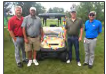
Flight 2, 1st Place (T) JDH Construction