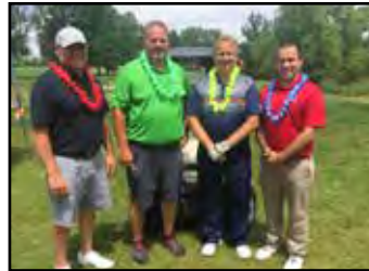
Flight 1, 2nd Place (T) Helms & Associates