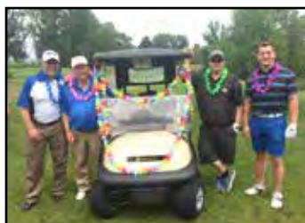
Demkota Ranch Beef/A&B Business