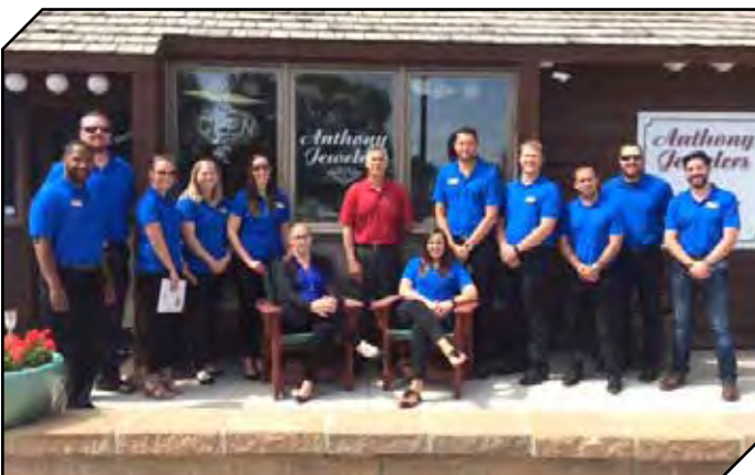
Anthony Jewelers 923 6th Ave SE • 605-225-9408 www.anthony-jewelers.business.site