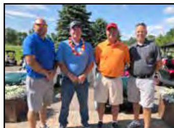
Flight 3, 3rd Place (T) First State Bank of Warner