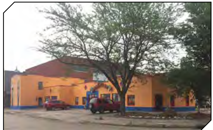
June - Mazatlan Mexican Restaurant 1 S 1st St