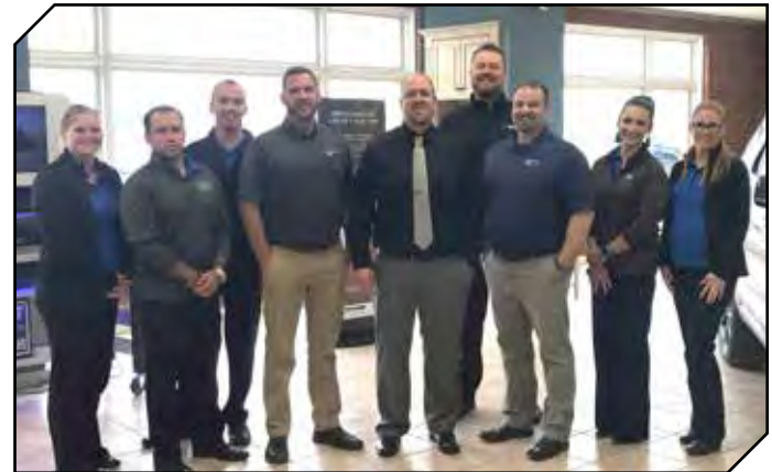
Pierson Ford Lincoln, Inc 701 Auto Plaza Dr • 605-225-3720 www.piersonford.com