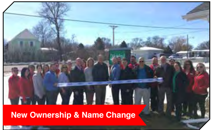
New Ownership & Name Change

Auto Zone 2402 6th Ave SE • 605-622-1042 www.autozone.com