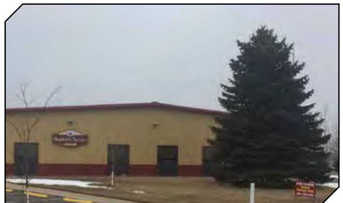
April – Hospitality Services 821 Circle Dr