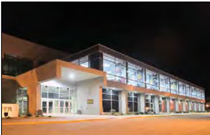
Barnett Center Addition - Aberdeen, SD

I am truly grateful to those who took the time to stop in. It means the world to me and helps me do my job as your representative. We have offices throughout the state as well, but if you're ever in Washington, D.C., please contact my office and let us know. I'd love to meet with you, give you a tour, or be a resource to you while you visit. I hope to see you soon.