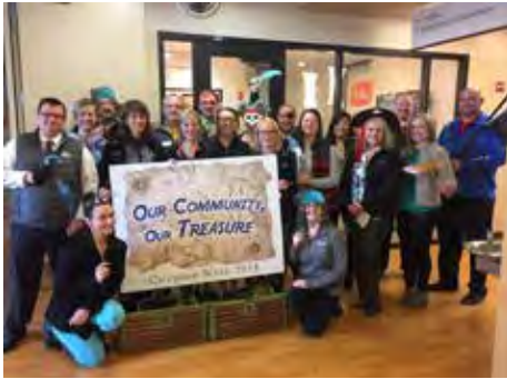
Profile by Sanford