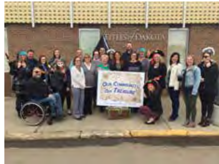
Titles of Dakota