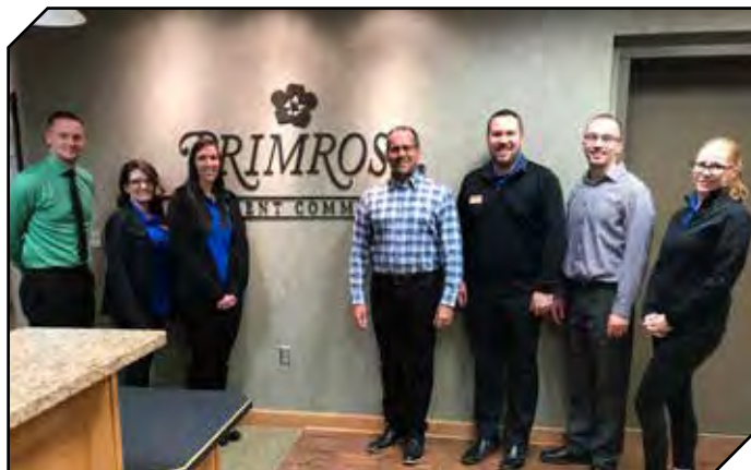
Primrose Corporate Office 815 N 2nd St • 605-226-2521 www.primroseretirement.com