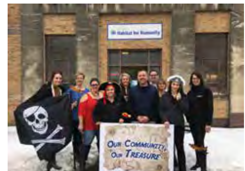
Habitat for Humanity