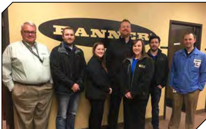
Banner Engineering 715 N Brown County 19 • 605-225-0225 www.bannerengineering.com