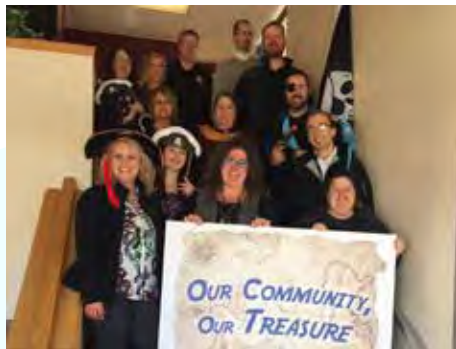
Lutheran Social Services