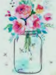
Catching Fireflies Boutique

DeAnna Hauge & Gina Sommers, Owners 304 6th Ave. SE, Aberdeen, 605-725-3473 www.catchingfirefliesboutique.com