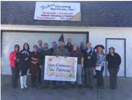
Fishers Cleaning Service, Inc.