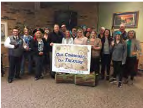
Aberdeen Health & Rehab