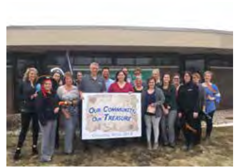
Plains Commerce Bank