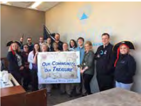
Diamond Dry Cleaning & Laundry