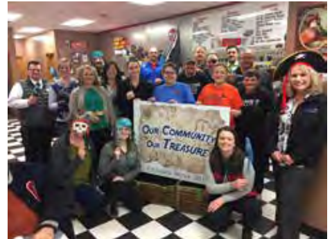
Airport Travel Center & Cafe