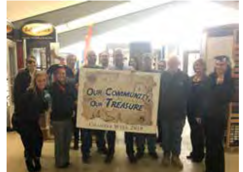
Town and Country Building Supply