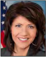
Kristi Noem US Representative (R-SD)

Never underestimate the power of your story to influence policy. It's advice I often offer those who ask what they can do to create change. Over the last month or so, dozens of South Dakotans have come to my Washington, D.C.,