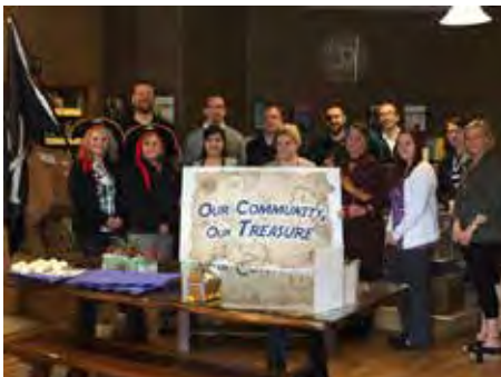
The Oil Room