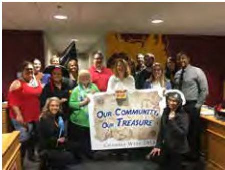
Northern State University

Solutions and Aberdeen Health & Rehab on winning those prizes! In addition to the week’s fun and activities, several businesses took advantage of the half price membership special, which was going on all week. A special thank you to Dacotah Bank for hosting Business After Hours, Primrose Retirement Community and Van Meter Entertainment for providing the “party buses” and all the volunteers who took time out of their schedules to help us celebrate Chamber Week 2018!