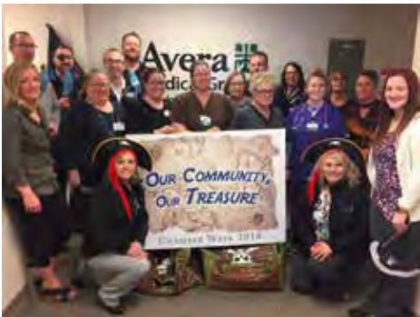
Avera Medical Group Internal Medicine