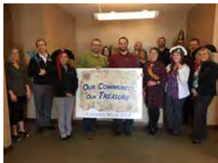
Helms & Associates