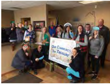
First Premier Realty