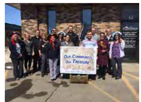
Plains Edge Chiropractic