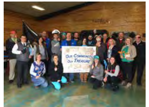
Dakota Outdoor Living