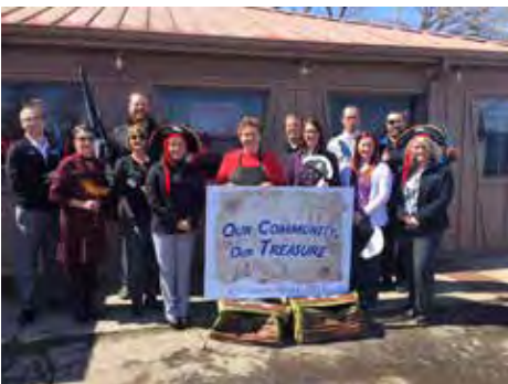
D's Fast Food & Catering