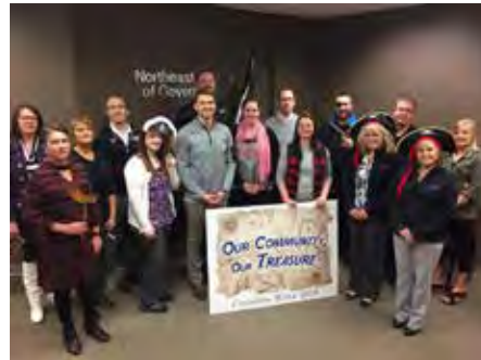
Northeast Council of Governments (NECOG)