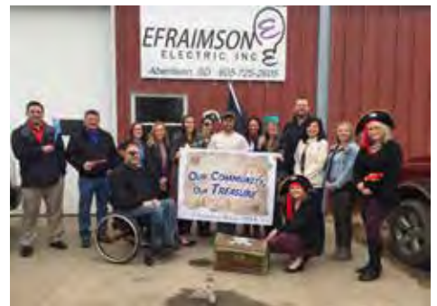
Eframson Electric, Inc.