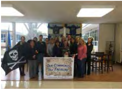
South Dakota School for the Blind and Visually Impaired