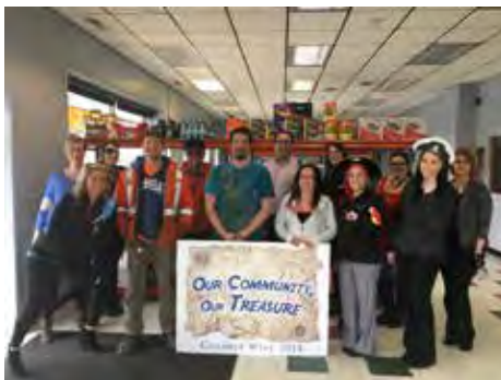
Crossroads Truck & Trailer