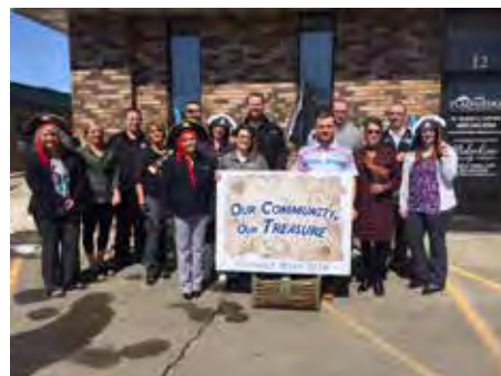
Ridgeline Massage Therapy