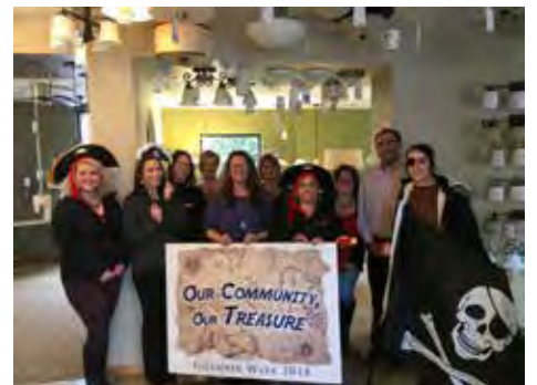
Court Street Lighting