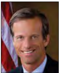
John Thune US Senator (R-SD)

The United States has experienced numerous technological revolutions throughout its relatively short history that have been so monumental that life as Americans knew it would