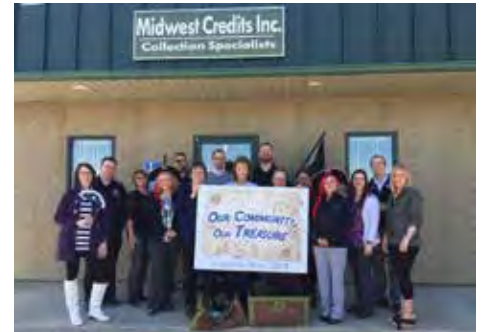
Midwest Credits Inc.