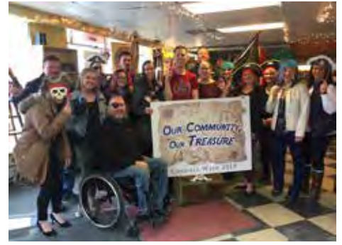
Red Rooster Coffee House