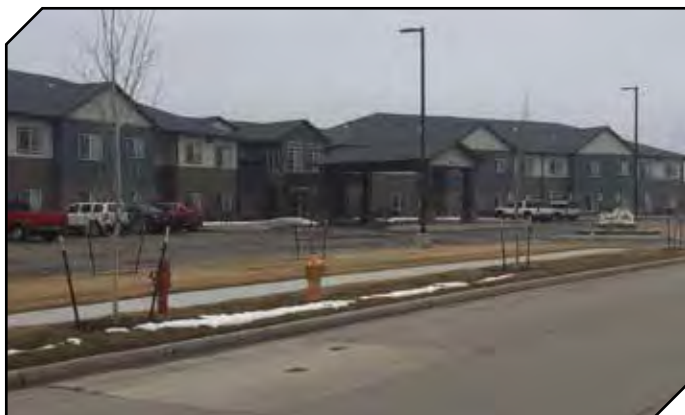
March – Central Villas 1901 S Merton St