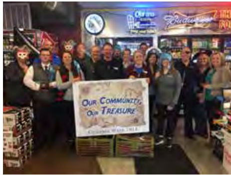
C-Express Wolf Stop