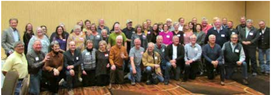
Aberdeen Central Class of 1974 at their 45th class reunion November 2, 2019.

"Last November at the 45th gathering of the Class of 1974, several classmates mentioned the possibility of giving back to the Aberdeen Public Schools in the form of an endowment for the children of the district. With the generosity of many in the class, the Endowment as of this date has