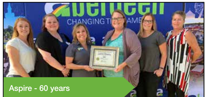
Aspire - 60 years