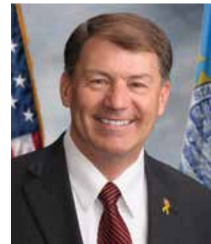
Mike Rounds US Senator (R-SD)

Maybe I'm biased, but life doesn't get much better than living in South Dakota. In larger places like California, New York or DC, you don't come across genuine "small world" connections like you do in South Dakota. I'm so proud to call this state my home and be part of this big family.