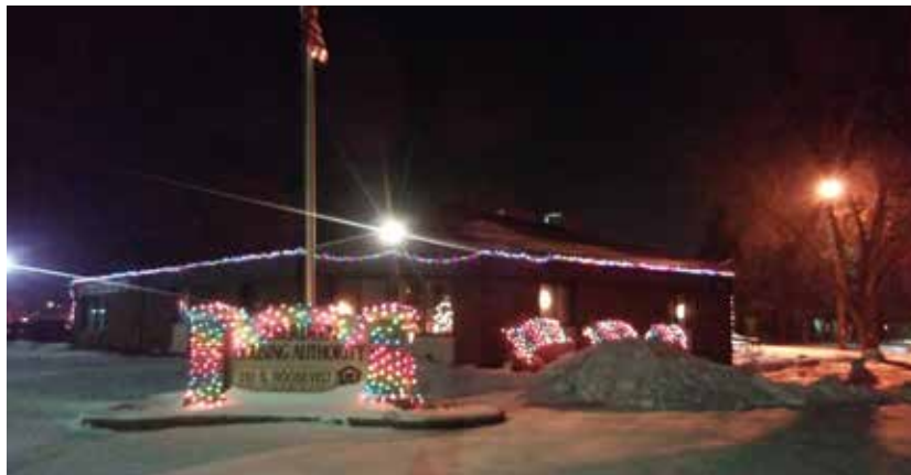
Aberdeen Housing Authority - 2019 Holiday Lighting Contest Winner

Judging will be based on lights and decorations, inside or outside, that can be seen from the street during a drive-by judging. So make a plan, shop local for your lights and decorations, and make sure to call the Chamber before December 2nd to let us