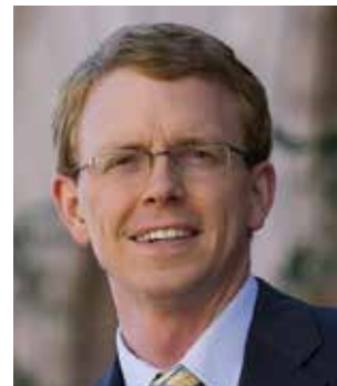
Dusty Johnson US Representative (R-SD)

The patient got the win this week – I'll keep fighting for lower prescription costs for all Americans.