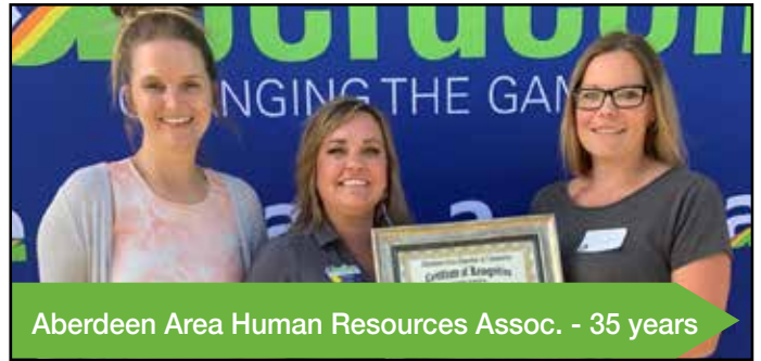
Aberdeen Area Human Resources Assoc. - 35 years