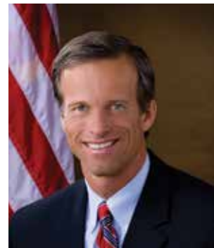
John Thune US Senator (R-SD)

Continuing the nationwide battle against the coronavirus will undoubtedly be one of Congress's top priorities this year, but, as you can see, we've got a lot of important issues on our plate. Regardless of what's in front of us in Washington, though, I will always fight for South Dakota's values and put the interests of our state ahead of everything else.