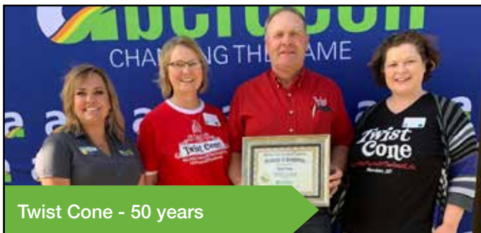
Twist Cone - 50 years