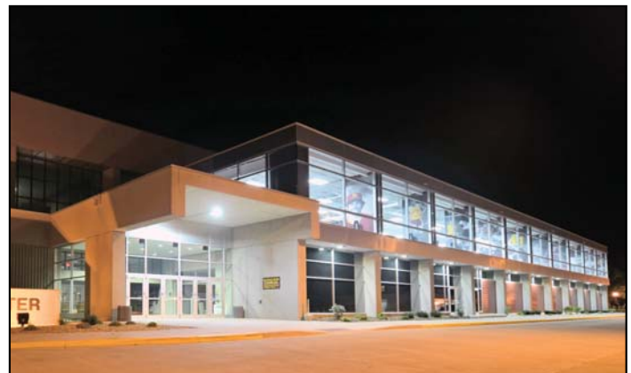
Barnett Center Addition - Aberdeen, SD

You Bring the Vision. We Bring it to Life.