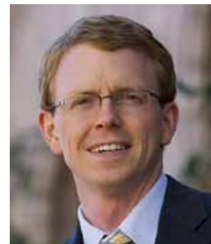
Dusty Johnson US Representative (R-SD)

With an estimated $1 trillion in COVID-19 relief still left unspent, this straightforward, common-sense approach will begin a serious investment in mental health resources for people across South Dakota and the United States.