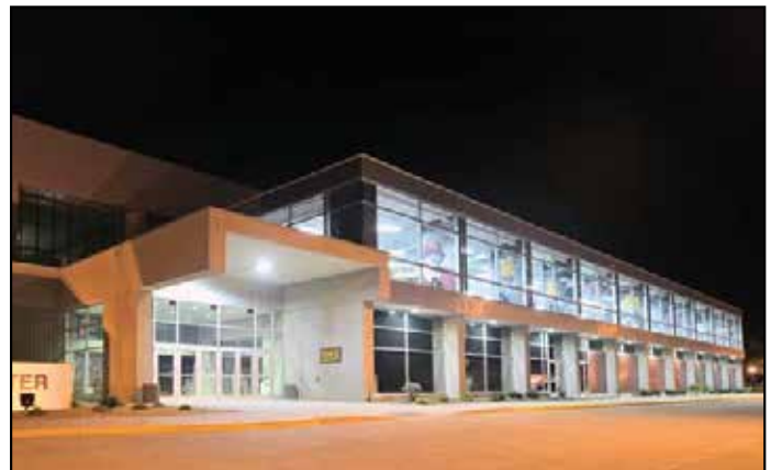
Barnett Center Addition - Aberdeen, SD

You Bring the Vision. We Bring it to Life.