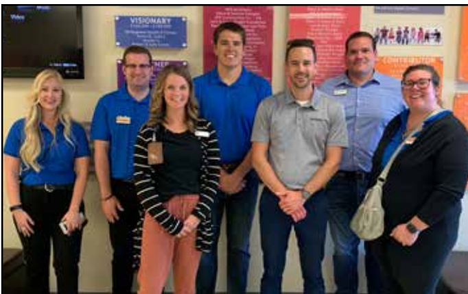
Aberdeen Family YMCA Youth Development Center 6 S State St • 605-225-7113 aberdeenymca.org/child-care