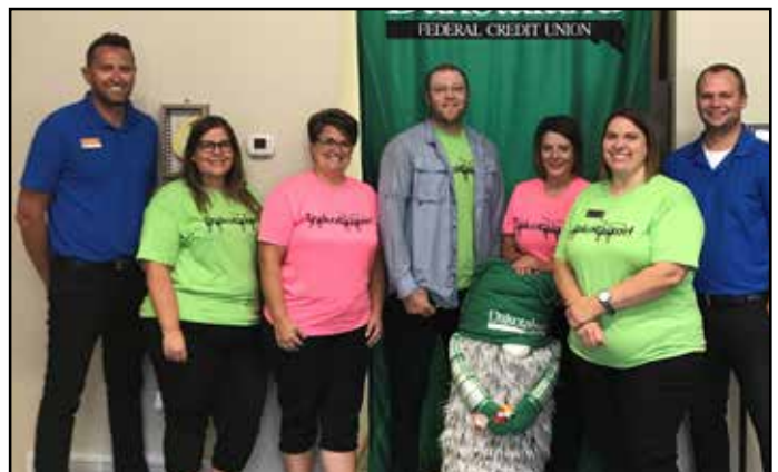
Dakotaland Federal Credit Union 1601 8th Ave NE • 605-226-2132 dakotalandfcu.com