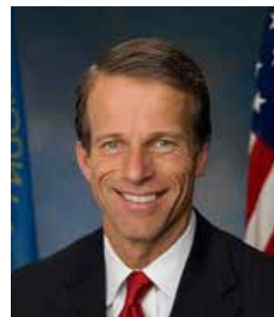
John Thune US Senator (R-SD)

Bottom line, if you need help with a federal agency or any of the other services I can provide, please reach out. You can call, email, or write any of my offices in Sioux Falls, Aberdeen, Rapid City, or Washington, D.C. Or stop by in person to say hello. We're here to help.